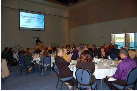
Guests Enjoy Dinner at the Expo

future, and just to say, 'thank you' to everyone who assists in our success."