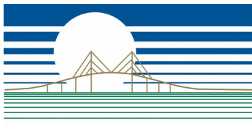
Tampa Bay Regional Planning Council